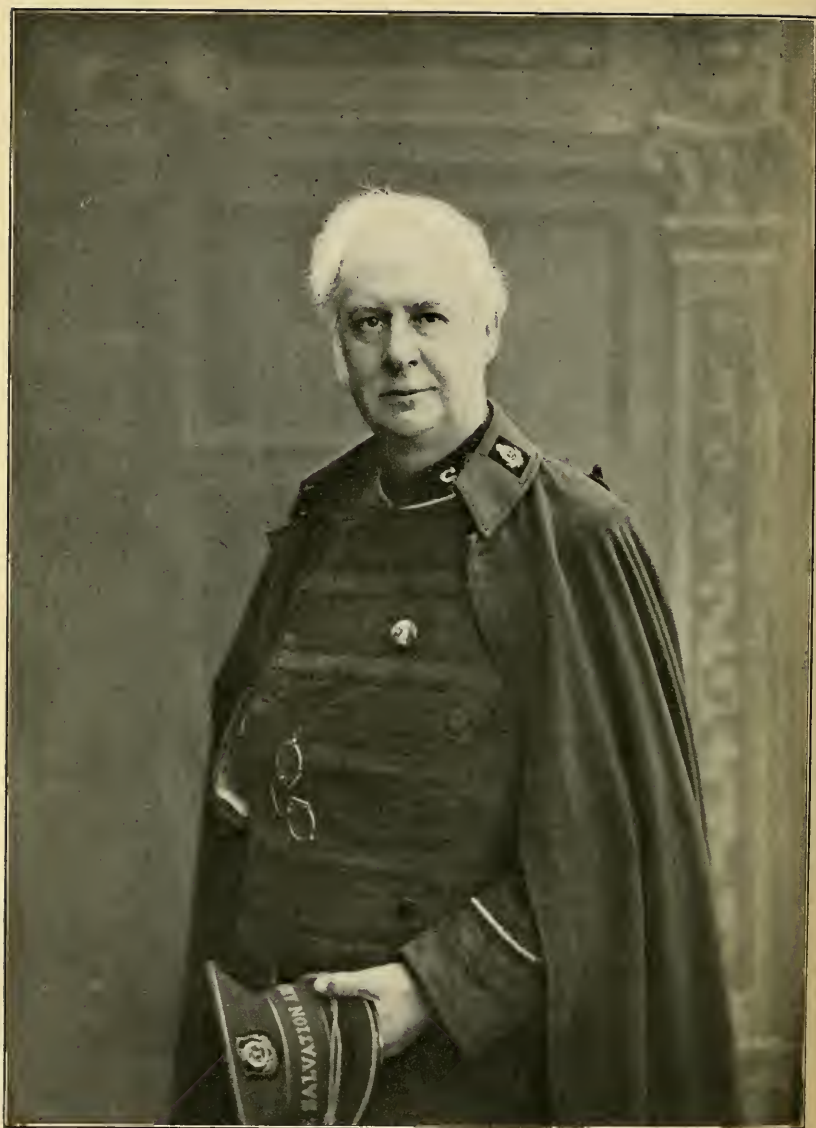
GENERAL BRAMWELL BOOTH