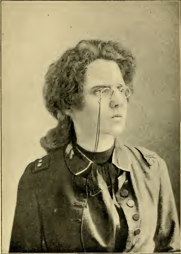
EMMA BOOTH-TUCKER (Died 1903)