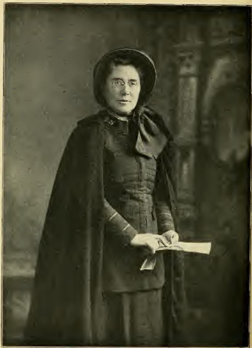
MRS. BRAMWELL BOOTH