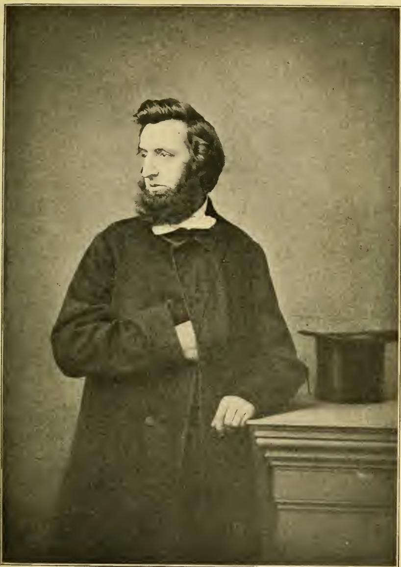
THE REV. WILLIAM BOOTH (1859)