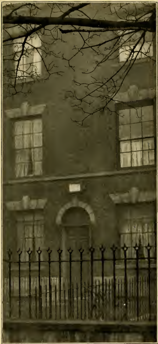
WILLIAM BOOTH'S BIRTHPLACE (Nottingham)