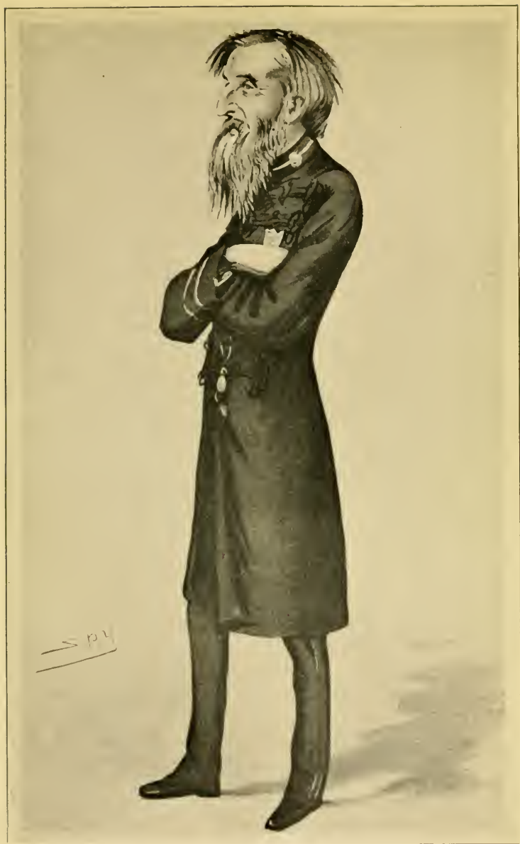
A CARTOON PUBLISHED IN VANITY FAIR (1882)