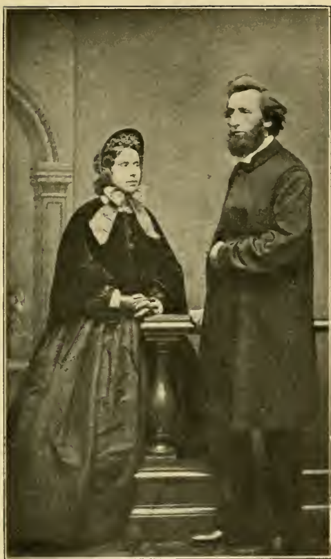
THE REV. WILLIAM AND CATHERINE BOOTH (1860)